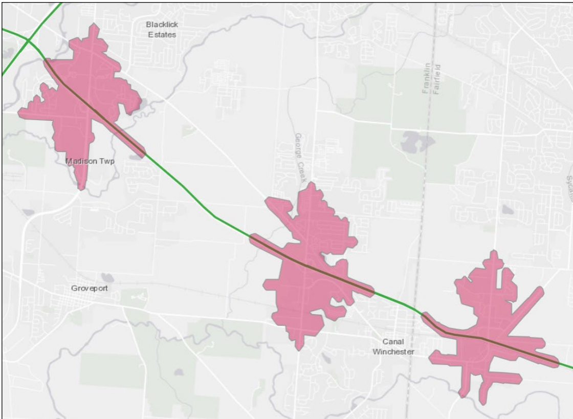
Figure 2: Example of Ohio Corridor Group Polygons

This figure depicts an example of three polygons at interchanges within a single corridor group. The polygons demonstrate the exact locations where an applicant could build charging sites.