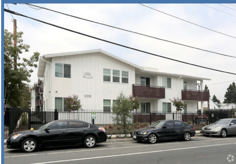
Mosaic Gardens at Pomona

An affordably priced and grid-interactive efficient apartment complex